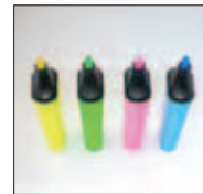
3LCD system* 2

See the difference with Epson 3LCD technology. It provides superb image quality and smooth natural colour.