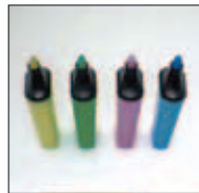
Single panel system* 2

Epson 3LCD technology vs conventional projector technology